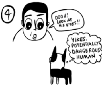
DON'T Stare him in the eye (This is an adversarial gesture)