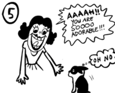
DON'T Squeal or shout in his face