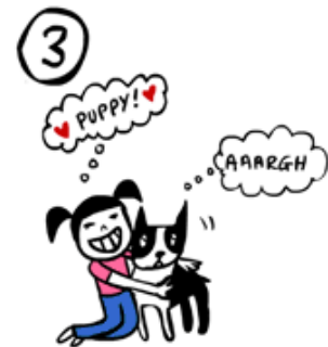
DON'T Grab or Hug him