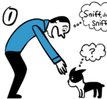
DON'T Lean over the dog & stick your hand in his face

Most people do this stuff and it stresses dogs out so they BITE! I don't care how cute you (or your kid) think Boogie is. Please show him some respect.