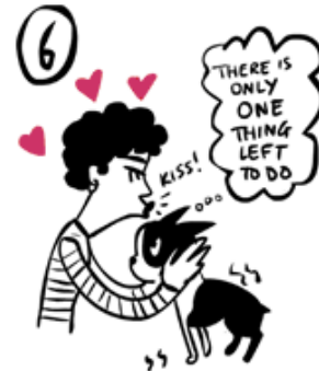
DON'T Grab his head and kiss it (This is an invasion of space)

Doing this to a dog who doesn't know you is like a perfect stranger giving you a great big hug and kiss in an elevator. Wouldn't that creep you out? And wouldn't you have the right to defend yourself?