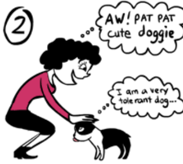
DON'T Lean over the dog & stick your hand on top of his head